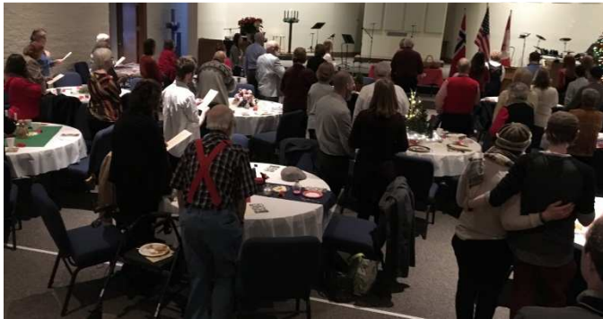
Edvard Grieg members singing the National anthems at Julefest 2018.