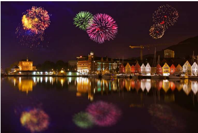
Fireworks in Bergen.

New Year wouldn't be New Year in Norway without the King's speech, fireworks or the clinking of glasses and best wishes for the year to come. What are the customs that make New Year in Norway... Norwegian?