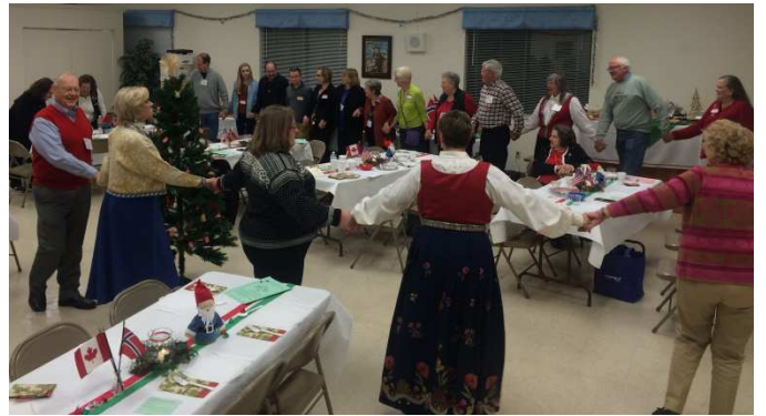
The Julefest tradition of dancing around the juletre (christmas tree)

Julefest on December 6 was our lodge's way of enjoying our Norwegian culture. We all had a great time with the tradition of Julefest. We especially enjoyed going around the Christmas tree as we sang carols.