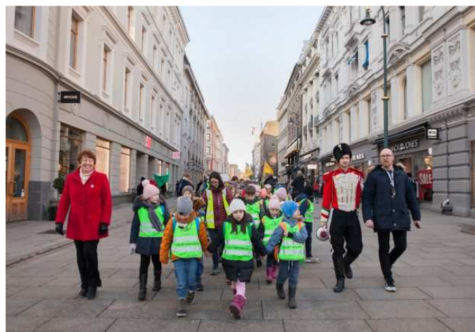
På vei!