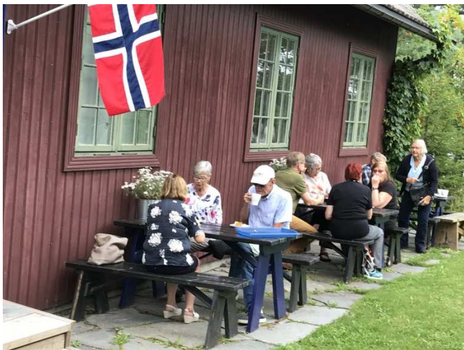
Norwegians enjoying coffee and sweets outside