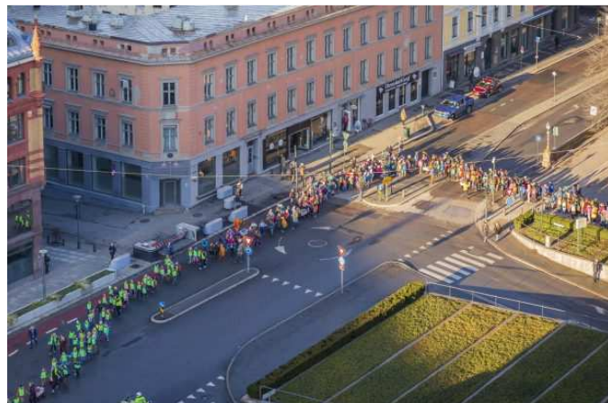
Barnas flyttebyrå.

What a wonderful way to involve the children with the book move. Surely something they will remember for the rest of their lives.