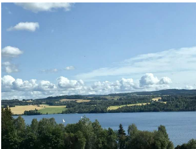
Lake Mjøsa (largest lake in Norway)