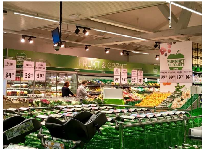
Inside Norwegian grocery store