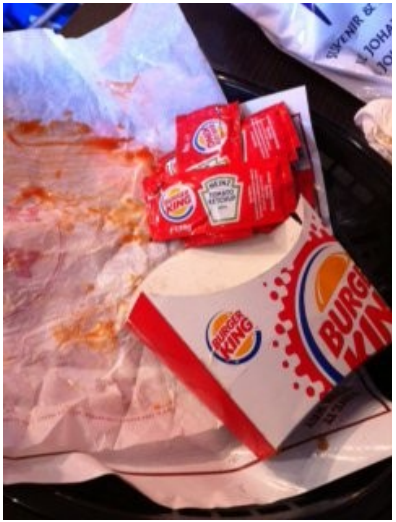
Homesickness cured (at least for a little while)