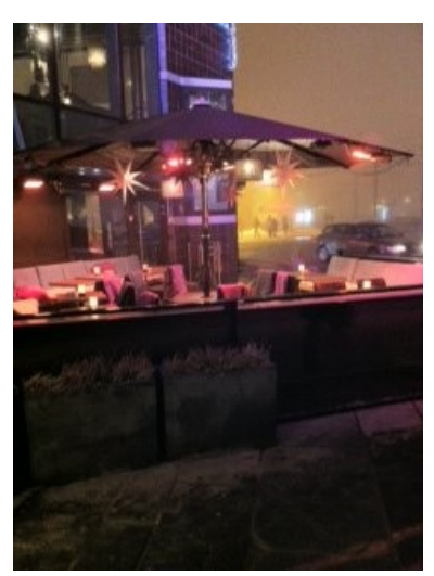
All smoking outdoors. Heating lamps are a necessity.

Donna's first train station – it reminded her of Siberia. Wonder when she was there?