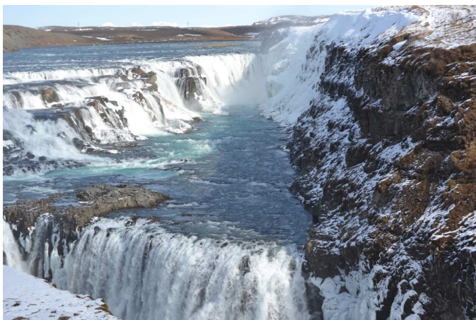
Photo of iceland from GeoCamp Iceland presentation