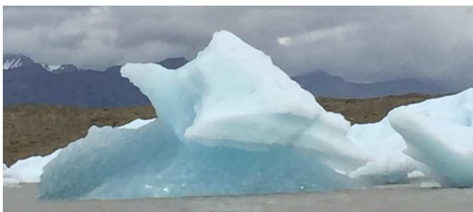
Photo of iceberg from GeoCamp Iceland presentation