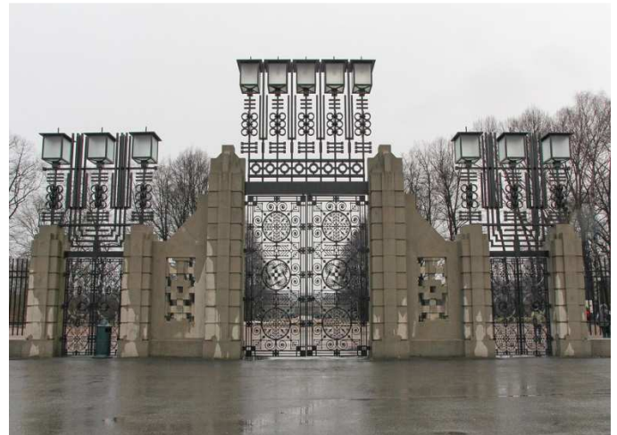
Wrought iron gate at Vigelandsparken