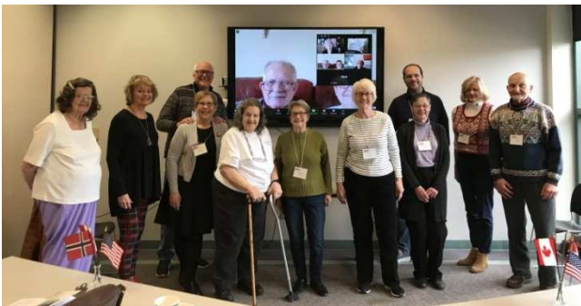
Lodge members at the April meeting