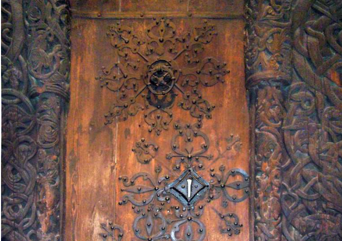
Wrought iron on a stave church

ornamentations used on large farms. Decorating everyday items that were part of daily life was common. It was believed that nothing was too insignificant to be decorated. Typical items were keys, fittings for chests and hutches, and knives and locks. Farmers took pride in the quality of the wrought iron made on their farms.