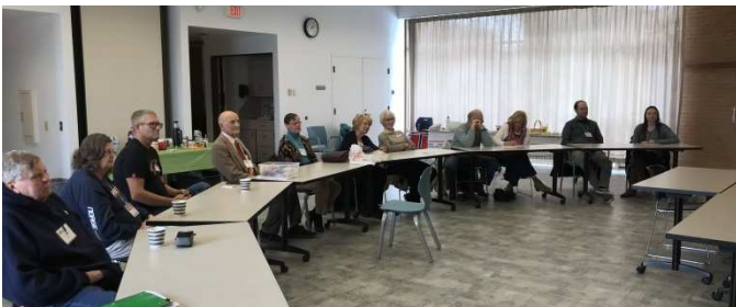
Lodge Members at the March Meeting