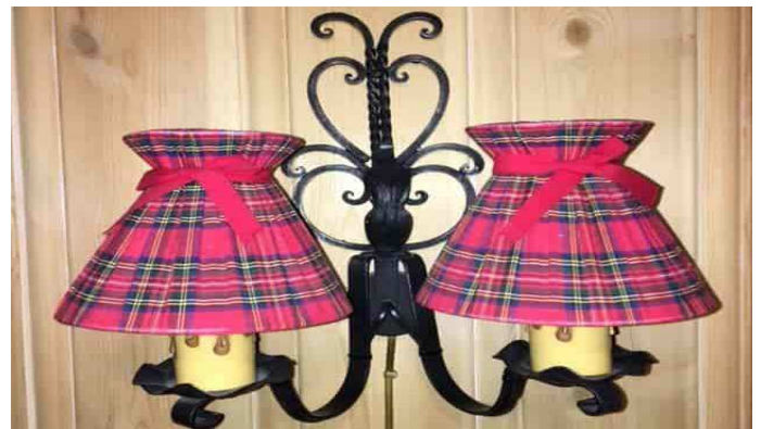
Modern Norwegian wrought Iron wall lamp

Wrought iron is still popular in Norway. Today, good quality wrought iron items such as candle sticks, lamps, fire screens, fire place tools and drawer pulls, can be purchased at Husfliden stores. Such items look particularly good in rustic Norwegian cottages. Custom wrought iron work can be ordered from workshops specializing in such work. Blacksmiths are in increasing demand to rehabilitate and restore old wrought iron. By doing such work they may be the counterweight to the "use and throw away mentality".