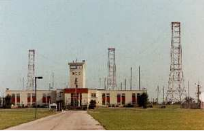
Voice of America Bethany Station: 1942–1992

There is no entrance fee, however, a contribution of at least $5.00 per person for ages 12 to adult and $1.00 for children 11 or younger is suggested. The tour will be approximately 1 hour and start with a 20 minute film.