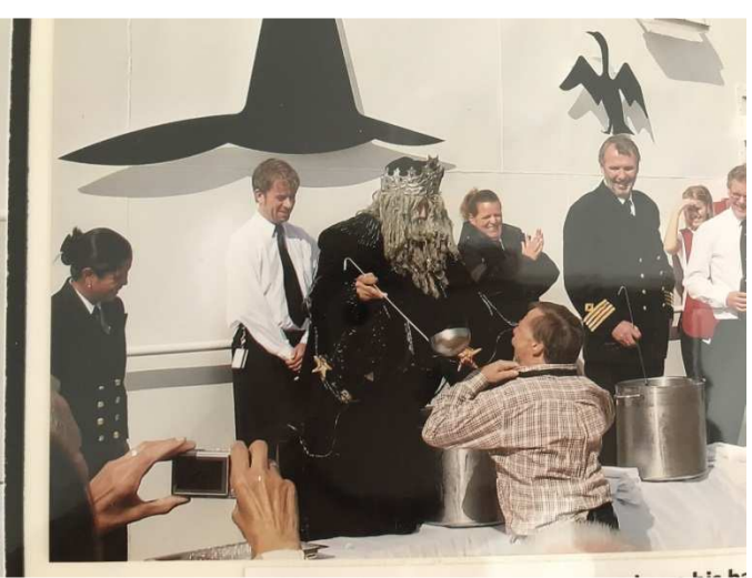
From Carol L: Fun with 'King Neptune' marking the crossing of the Arctic Circle

And a reminder of the District 5 Scandinavian Photo Contest for playing cards (submit up to 5 photos by July 5, 2020 deadline). <u>http://www.sonsofnorway5.com/conventions/conventions/convention_contest.php</u>