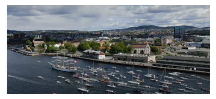
So in spite of all the cancellations of many traditional May 17 traditions, a great and memorable day was had in Oslo.

As an alternative to the children's parade this year, the Oslo Sail Club had suggested that boats could join the sail ship Christian Radich for a parade on the Oslo Fjord. The club had expected that maybe 40 boats would show up. To everybody's surprise more than 2000 boats joined the parade, many decorated in honor of the day. A video posted on the web showed the parade, a beautiful sight.