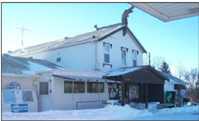
Norway Store, Norway IL