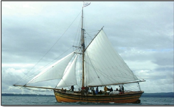
Reproduction of the Sloop Restauration