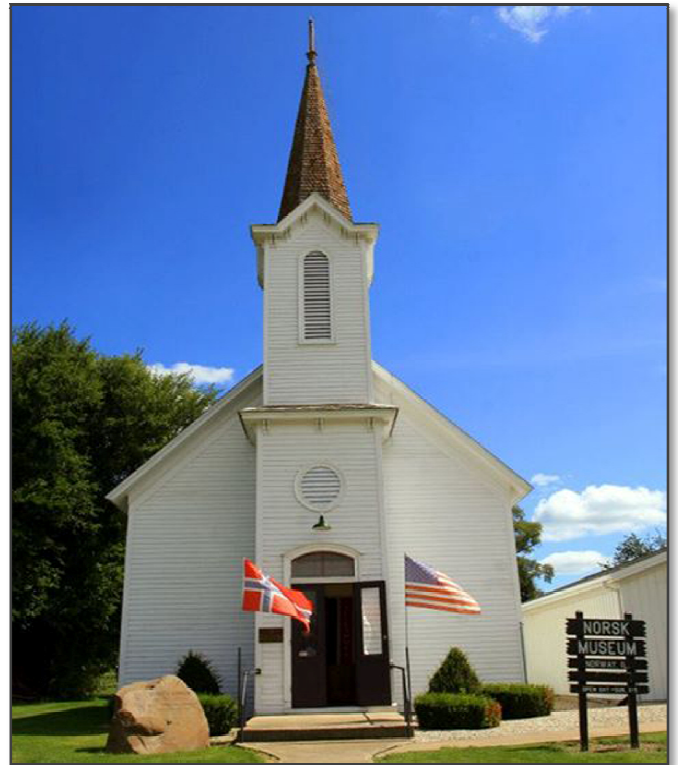
Norway Museum, Norway IL

A stop at the Norway Store is a step back in time! I stopped in a few years back on my way to Wisconsin because I was curious about the name. Little did I know the significance of this little unincorporated village. The owner of the store approached me as I was obviously not one of his usual customers. He is quite a character and his stories added to the delight of that store. Barrels of lutefisk were lined up. A delivery of fresh fish (in their original state) arrived to their "fish" room to be deboned and cut to the liking of their customers and for their many freezers full of everything you can think of. It is also an old-fashioned meat market, post office, gas station and more; a true general store. They also serve food.