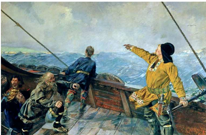
Leiv Eiriksson discovers America by Christian Krohg (1893)

On October 9, it would be wonderful for you all to greet everyone that you meet with “Isn’t this a wonderful Leif Erickson Day”? It took me checking several calendars in our house until I finally found the date noted on the Paulstad Norwegian calendar. Every year starting with 1964, the United States President has issued a proclamation on October 9, praising the contributions of Americans of Nordic descent. Another interesting fact is that October 9 is not associated with any particular event in Leif Erickson’s life. The date was chosen because the ship Restauration coming from Stavanger, Norway, arrived in New York harbor on October 9, 1825. It was the start of the first organized immigration from Norway to the United States.