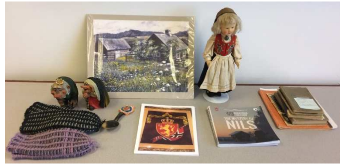
Norwegian Treasures from 'Bring a Thing' sharing