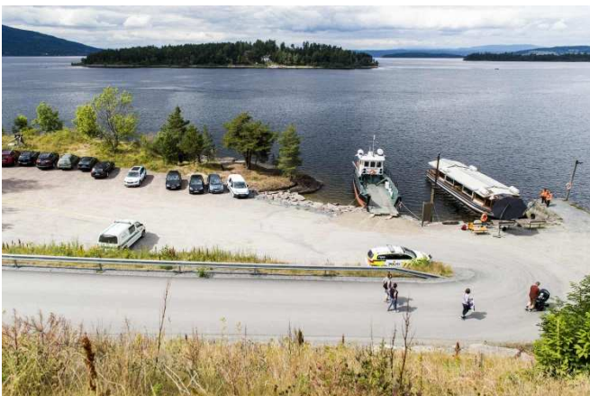
Utøya.

A film about the July 22nd terror attacks carried out by right wing extremist Anders Breivik in Oslo and on the island of Utøya will be produced by streaming giant Netflix.