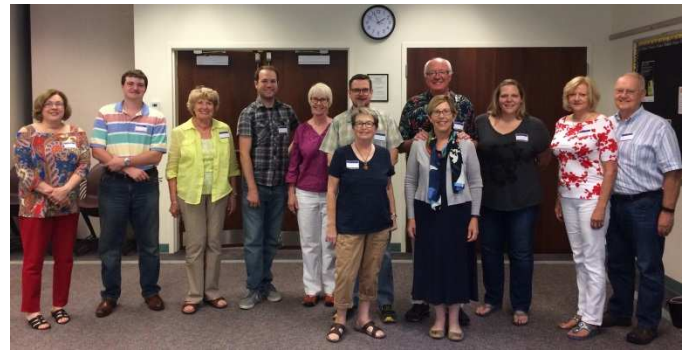
Attendees of Soup & Salad 'Bring a Thing' meeting